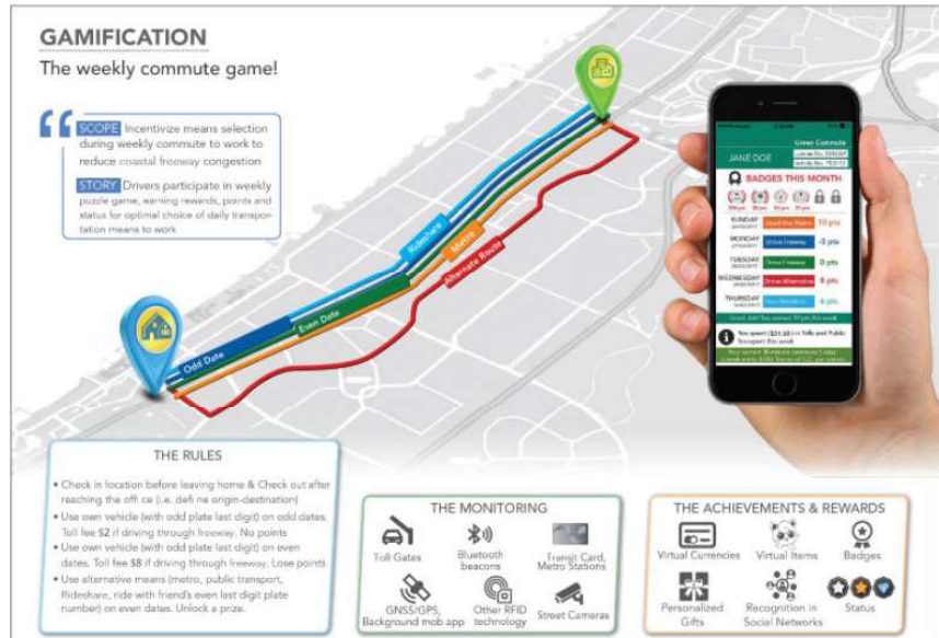
Figure 5, Sample of how various routes and mode choices result in points earnings in a given game campaign.