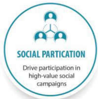
Figure 4. Three main outcomes of gamification are integrated as goals of the gamification platform. In fact, the outcome of social participation is often seen as a driver for social behavior. For example, campaigns intended to address impaired driving often rely on social stigma generated from social participation in group activities. (Transpo Group, 2018)

as following too closely and lane discipline. Additionally, user behavior such as alcohol abuse coupled with driving has been altered significantly where traffic safety campaigns have included a social stigma element. The power of social media engagement and user behavior is a key component of the gamification of transport choices.